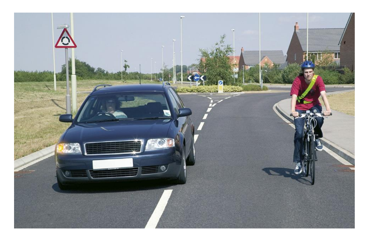
Rule 163: Give vulnerable road users at least as much space as you would a car

Large vehicles. Overtaking these is more difficult. You should